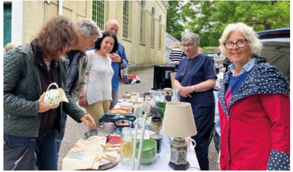
The plant sale and car boot fair at St Swithun's was a hit, offering bric-a-brac, teas, plants and much more!