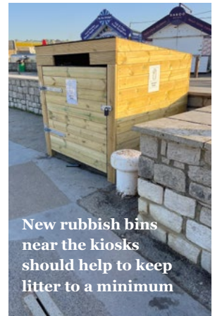
New rubbish bins near the kiosks should help to keep litter to a minimum

as without this there is no evidence of the problem. Inconsiderate parking in Meadowlands also came up, including people even parking over driveways.