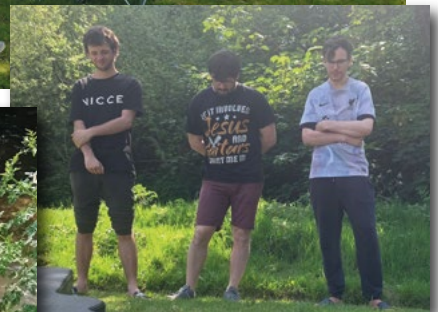
Three young men were baptised in the river during the Beacon's celebration service in May

If you are considering baptism, faith or simply whether there is something more than just us in this universe, we would love you to join us at Beacon Church. We are open 11am to 2pm on Wednesday and Thursday for the community kitchen and every Sunday from 10am to 12.30pm.