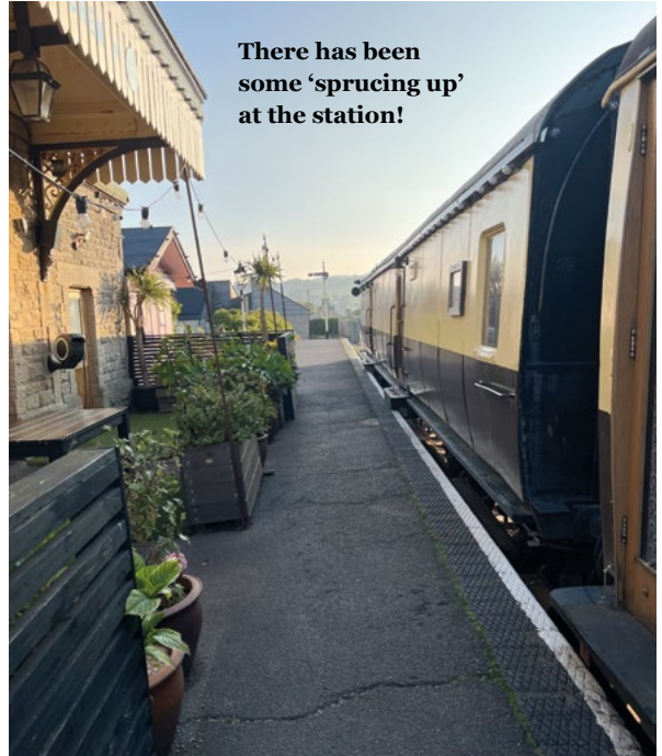
There has been some 'sprucing up' at the station!