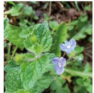
From top: investigating finds at Bradpole's annual nature count; a molehill by a gravestone is evidence of underground activity; local botanist Fiona Wood; flora and fauna in abundance

refreshments. Other activities included groups for fellowship and craft, organising the village lunch club, the monthly village brunch, bellringing and training, and the monthly visits to Bradpole Pre-school. The Friends of Holy Trinity were also very active during the year having arranged coffee mornings and afternoon teas, a Desert Island Discs evening with the Revd Janis