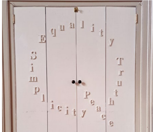
A cupboard door in the Quaker Meeting House is decorated with the four testimonies

The temptation is to give up before beginning and so to fail. But there is help. That’s the power of community to encourage and support, that’s the power of believing together. By supporting each other we may not achieve perfection, but we can try. With a smile, I have heard the phrase that my right to punch my enemy stops just before the end of their nose! Controlling feelings of aggression and so on is a life-long task but that doesn’t