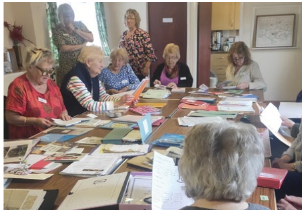
Pictured: WI members have started planning an exhibition to mark their centenary next February